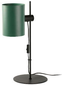
Table lamp with a cylindrical shape in green finish designed by Faro Lab . A unique design to give a modern touch to any space. Allows the light to be directed more firmly. Black structure. Lighting solutions designed for global markets, compatible with mains voltages: 110 - 120V and 220 - 240V.